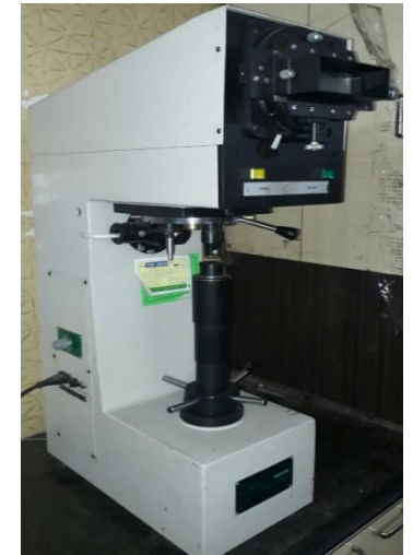
Hardness Testing Equipment