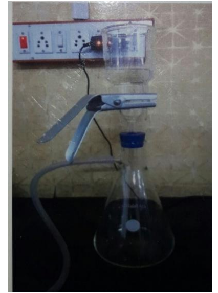
Contamination Testing Kit