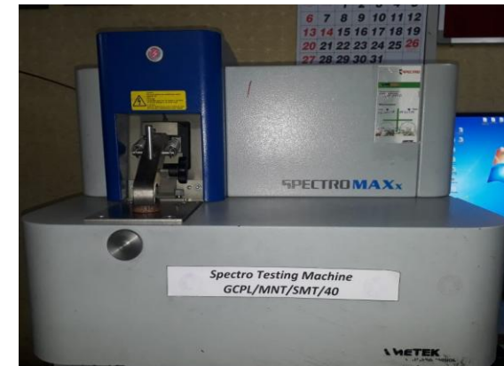
Spectro - Analysis