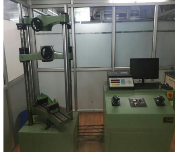
Universal Testing Machine